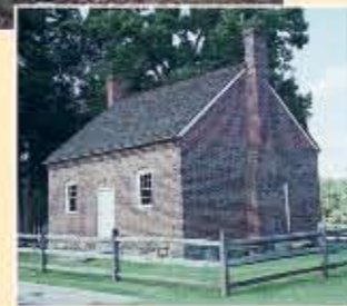
Quaker Friends Meeting House Circa. 1800's